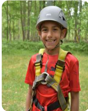
SAWYERS Ages 9-11