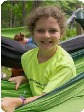
CRUISERS Ages 6-8