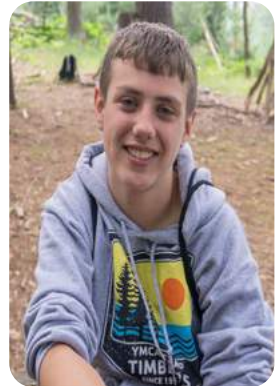
TOPPERS Ages 12-14